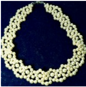
Free pattern for necklace Milli