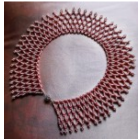
Free pattern for necklace Pembe