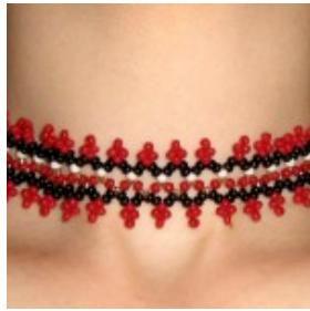
Free pattern for necklace Ashberry